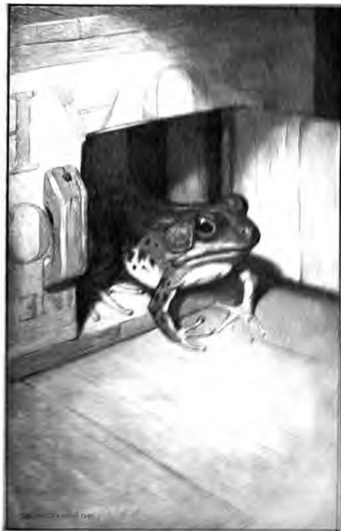
THE FROG AND THE LIGHT